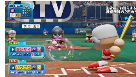
eBASEBALL PAWAFURU PUROYAKYU 2022