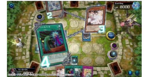
Yu-Gi-Oh! MASTER DUEL