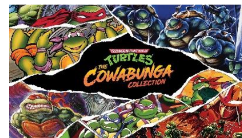
Teenage Mutant Ninja Turtles: The Cowabunga Collection