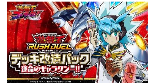
Yu-Gi-Oh! RUSH DUEL Core Booster Pack