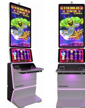
DIMENSION TOP Box