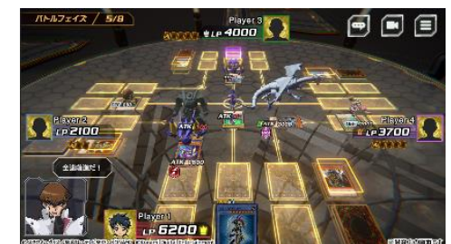
Yu-Gi-Oh! CROSS DUEL

©2020 Studio Dice/SHUEISHA, TV TOKYO, KONAMI