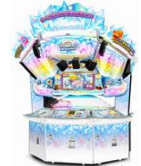
ColorCoLotta Frozen Island