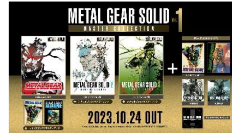
METAL GEAR SOLID: MASTER COLLECTION Vol.1