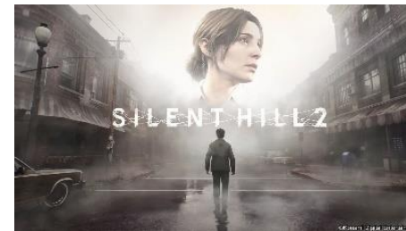
SILENT HILL 2