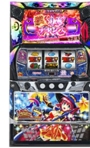
Magical Halloween 8