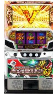
MAH-JONG FIGHT CLUB Kakusei