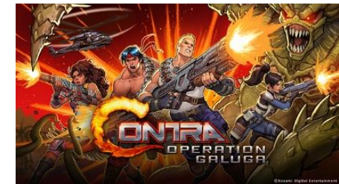
Contra: Operation Galuga