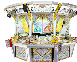
FORTUNE TRINITY Jiku no Diamond