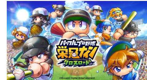
PAWAFURU PUROYAKYU Eikan Nine Cross Road