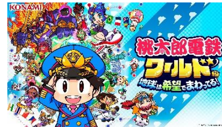
Momotaro Dentetsu World -Chikyu wa Kibou de Mawatteru!-