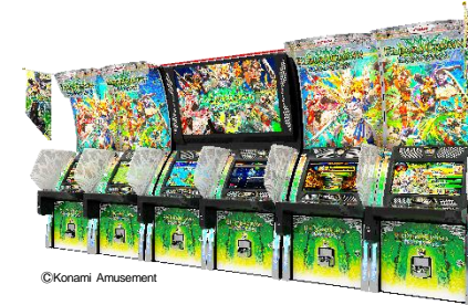
ELDORA CROWN Yukyu no Labyrinth