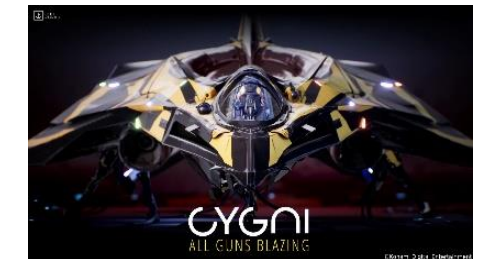
CYGNI: All Guns Blazing